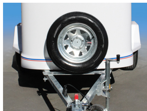
• Spare Wheel fitted to front of body