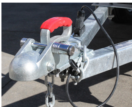
• Keylock Towbar