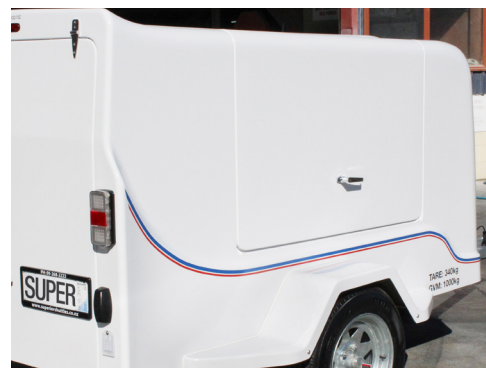
• Right roadside door

Disclaimer: As our policy is one of continual development, specifications and claims in this document are correct at the date of printing and can change without notice.