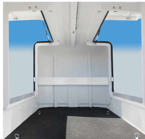
• Front timber shelf