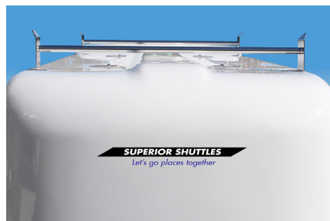
• Stainless steel roofracks

Whatever your needs, we have a CAT to do the job with style. Call us today and talk directly to the experts.