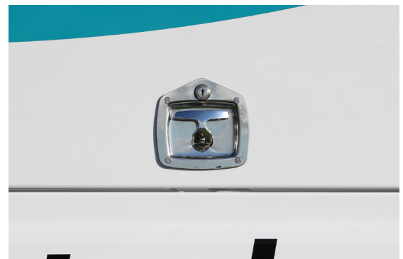
• Side door key lock