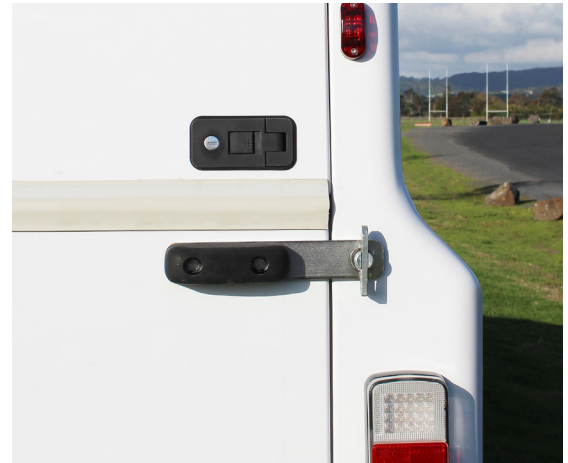
• Rear door key lock