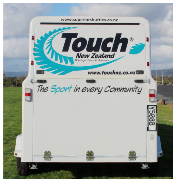
• Tripple hinged ramp for durability