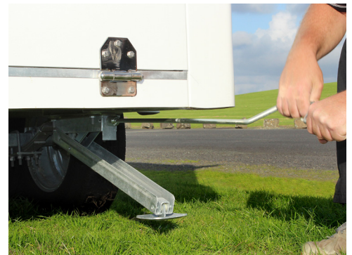
• Rear stabilisers

Rear adjustable stabilisers help to make our MaxiCAT a multi-function service station for event managers, refreshment distribution or a first aid station.