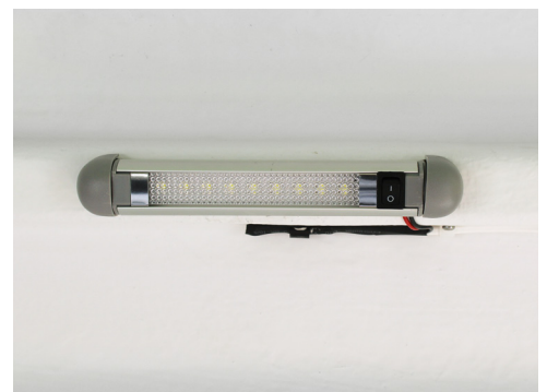
• Interior LED bar lights

Disclaimer: As our policy is one of continual development, specifications and claims in this document are correct at the date of printing and can change without notice.