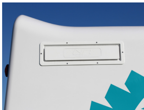
• Air vents to stop mould